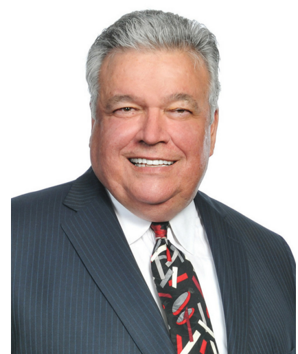
William G. Christopher